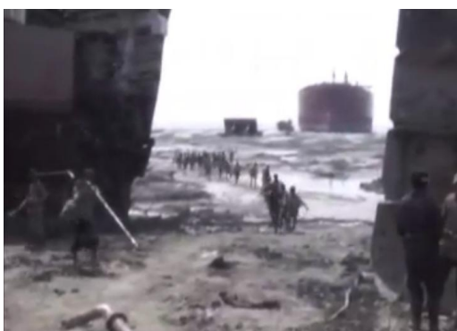
Fig.4 Ships at the Chittagong yard

The media archives are vast, but perhaps more attentive to planetary (planets, animals, soils) and molecular (cells, genes, organs) violations than to global distributions of harm. Yet the occasional spectacular artistic venture or the collective intelligence of blogs tunes us to the “unhomely social” (peopled by withering bodies) of which we are a part. In her 17-minute silent documentary on the Chittagong ship-breaking yards, The Last Rites (2008), Yasmine Kabir offers mute witness to the demise of ships. 33 The aesthetically pleasing stark images that capture the undulating kinesthesia of labor and the abstract industrial music score are troublingly pleasurable. On the one hand we are lulled into appreciation; on the other, since the document has no explanatory voiceover, we are forced to do the conceptual work ourselves. What are these images? Who commands these actions? What is the story? Are these just clips of everyday life? Does it record of a singular event? The disjuncture galvanizes, as defamiliarization always does. Beyond critical distance, the poetic fragment immerses us within the metals, waters, toxins, sweat, and breath of the world on screen.