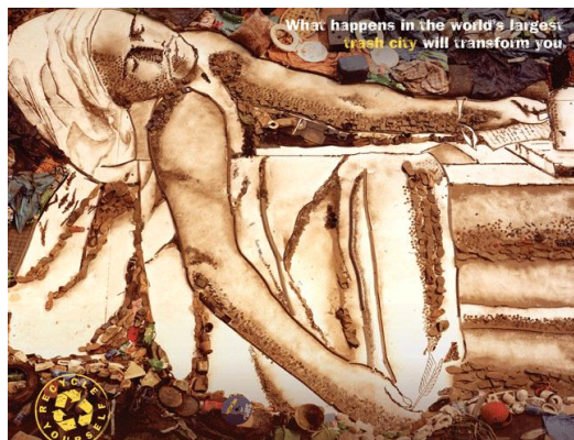
Fig.2 Vik Muniz' self-portrait

By contrast, it is far harder to sort, select, and assemble those speculative media that aspire to a world “to come,” a becoming that remains latent and uncertain. An example appropriate to the following discussion arrives amid squalor. When artistic collaboration on a documentary, Waste Land (2010), inserted Vik Muniz, one of the recyclers at Rio de Janeiro's infamous Jardim Gramacho dump, into an iconic image reminiscent of the French revolution (Jacques-Louis David's The Death of Marat , 1793), the exuberant appropriation of “high art” signaled local aspirations to become worldly—local, in the concrete recycled raw materials of the self-portrait (Fig.2). 6 The portrait would enter the world art circuit, the recesses of the global haunting the metropolitan centers where the exhibit traveled.