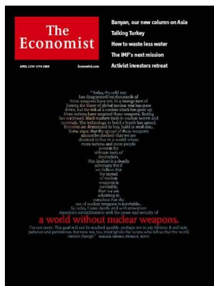
Fig.1 Obama's Prague address 5

When the cover of The Economist featured Barack Obama's Prague 2009 speech writ as a familiar mushroom cloud, the iconic image codified a universal enemy (the split atom) that threatens the entire planet (Fig.1). We are all in this together, goes the rhetorical strategy; the world is here, and our common task is to secure life against existing wrong. The apocalyptic cover, a staple for The Economist these days, exemplifies the totalizing world picture, the abstract global that finds ample representation across media.