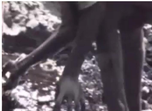
Fig.7 Elbows deep in sludge

Frames from Yasmine Kabir's The Last Rites