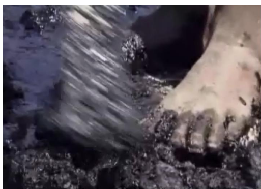
Fig.6 Immersed in toxic sludge