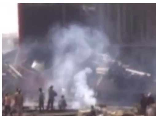
Fig.5 Fumes cloud the yards